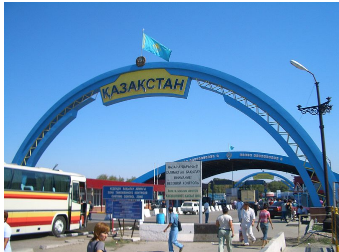
Border crossing between Kyrgyzstan and Kazakhstan at Kordoy in 2007.

Regardless of actions taken at sub-regional levels and within particular states, borders will remain an important hindrance to regional integration, but they can also serve as a possible point of solution to many of the challenges described above. The current borders were designed artificially and in recent history. Therefore, they are subject to the permeation of goods and people so long as good strategies are adopted that can provide the right balance of security and transit.