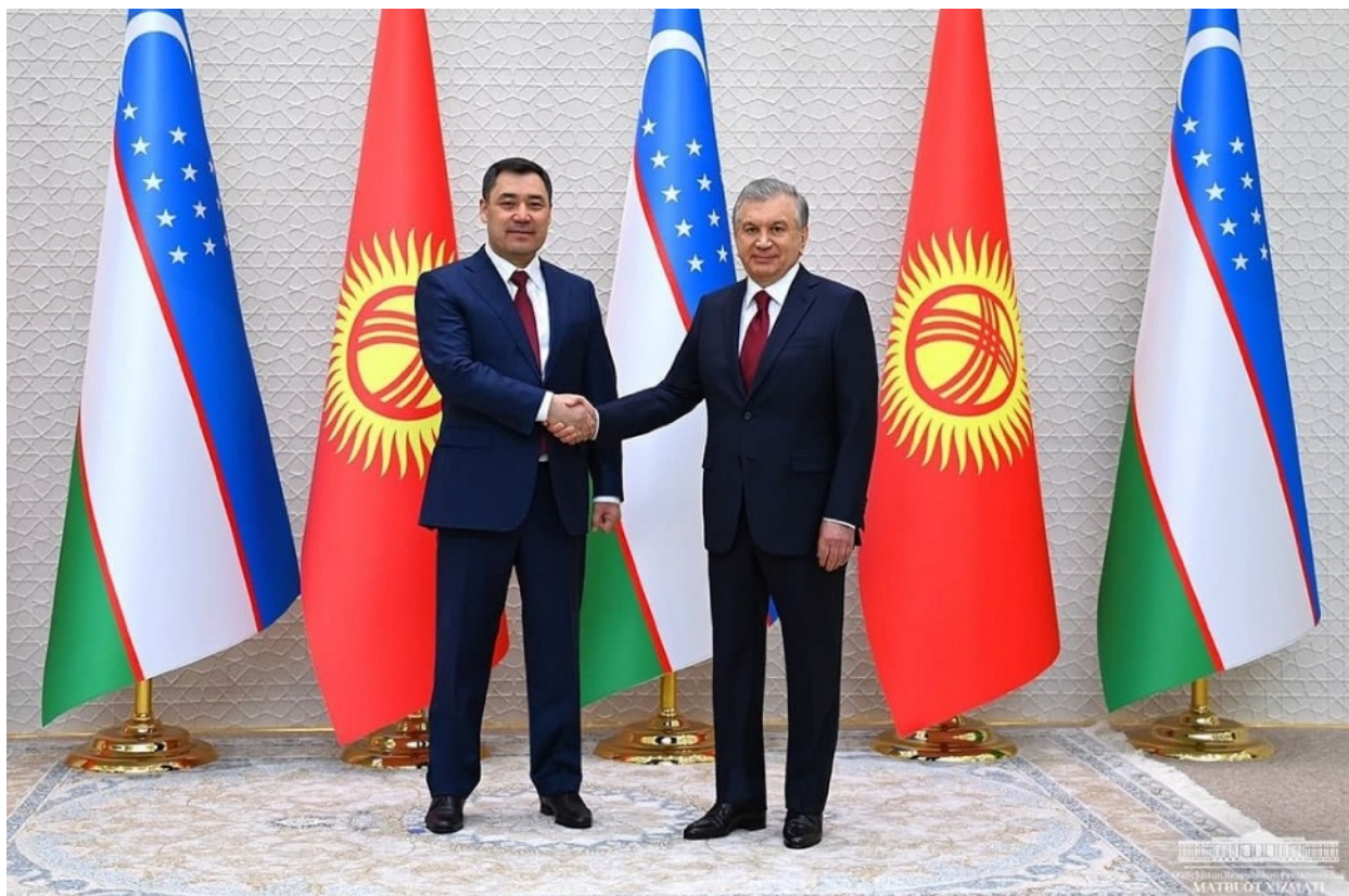
Uzbekistan President Shavkat Mirziyoyev and Kyrgyz President Sadir Japarov. Uzbekistan was one of the first countries in the region to declare Islamic extremism a major threat, resulting in restrictions on Islamic civil society. In contrast, Islamic Civil Society may have room to grow in Kyrgyzstan, given Japarov's conservative populist stance.

and madrassas. In 2011, Tajikistan passed a Law on Parental Responsibility, which banned under 18s from attending mosques under most circumstances and made it illegal to study Islam abroad without government permission. Following Russia's lead, the Central Asian governments introduced laws on extremism and terrorism. 19 Each regime has adopted similarly broad and amorphous definitions of terrorism and extremism. 20 Uzbekistan, for example, defines terrorism as a "socially dangerous act." Crimes that are considered "extremist" under the 2003 Law on Extremism in Tajikistan include insulting national dignity, unsanctioned rallies and calling for the overthrow of the government. Two of the Central Asian countries, Tajikistan and Turkmenistan, are classified as "countries of particular concern" by the Department of State under the International Religious Freedom Act.