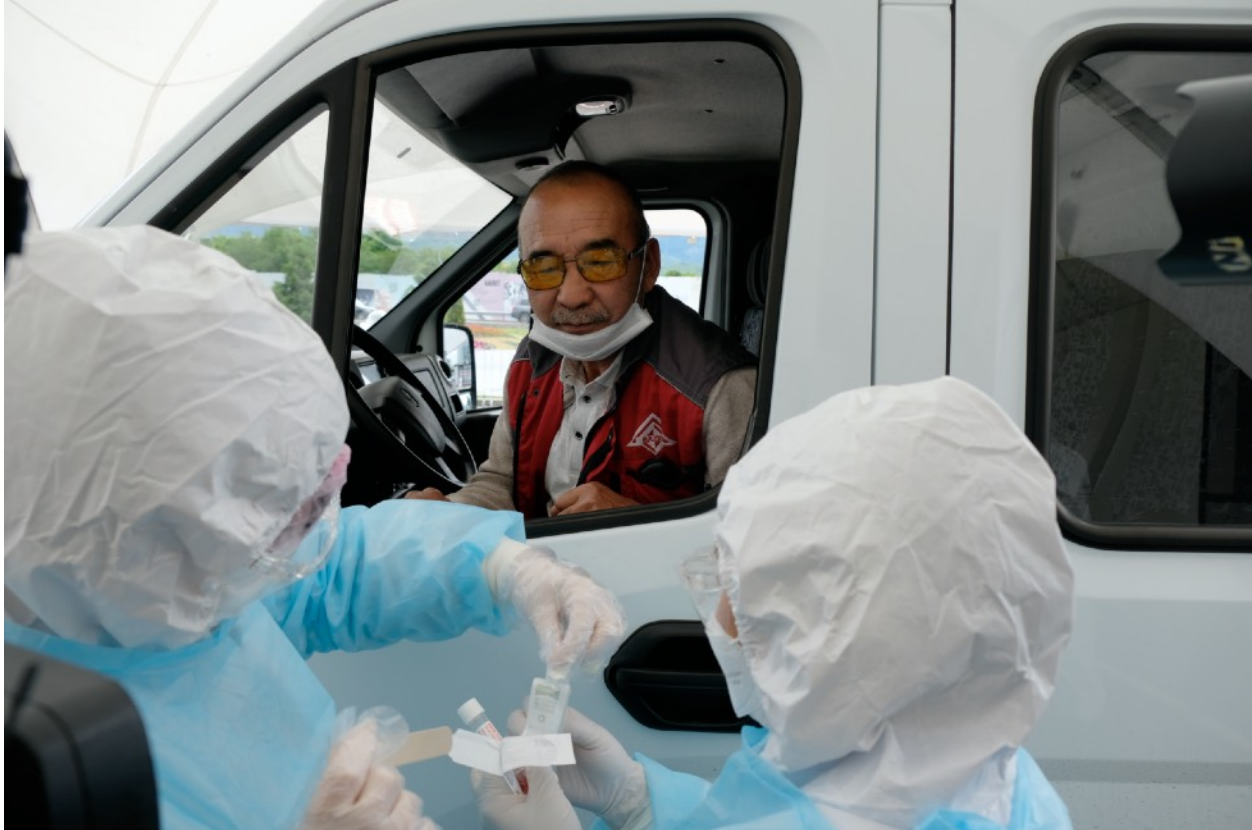
Islamic charities have played a significant role in filling gaps in response to the COVID-19 pandemic.

These organizations function to collect and distribute aid, sometimes in the form of coalitions, and often with support from donors in Saudi Arabia, the UAE, and Qatar. According to participants, the most common activity they engage in is the construction of mosques throughout the region. In addition, foundations engage in social projects providing schooling, hospital services, distributing meat during Eid al-Adha and organizing traditional iftar dinners. Some have even been noted as providing critical infrastructure, such as irrigation and clean water supplies.